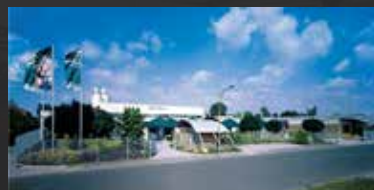
Silikal production and administration in Mainhausen, near Frankfurt/Main, Germany.

Contact us. We would be pleased to go into detail with you – at no cost or obligation to you, of course.