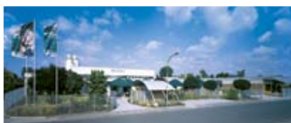
Silikal production and administration in Mainhausen, near Frankfurt/Main, Germany.